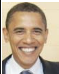
Barack Obama Democrat